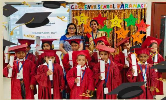
CELEBRATING TINY TRIUMPHS