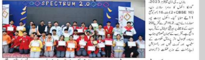
پانچویں ڈی جی ڈی گوینیکا اسکول کی دوسری سالگرہ، اسپیکٹرم 2023 کا انعقاد

پانچویں ڈی جی ڈی گوینیکا اسکول کی دوسری سالگرہ، اسپیکٹرم 2023 کا انعقاد۔ اسکول کے بچوں نے اس موقع پر اپنی صلاحیتوں کا مظاہرہ کیا اور ان کے لیے تمغے اور سرٹیفکیٹس دیے گئے۔ اس موقع پر اسکول کے سربراہان نے بچوں کو مبارکبادیں پیش کیں اور ان کے مستقبل کے لیے نیک خواہشات کا اظہار کیا۔